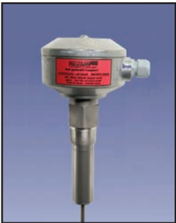
CVR-600 Vibrating Rod

Power Requirements: Wide range 20-250V AC/DC Relay: SPDT relay, 5A @ 250 VAC (optional DPDT relay available) Time Delay: 1 second from stop of vibration, 2 to 5 seconds for start of vibration Ambient Temp: -4°F to +150°F (-20°C to +65°C) Process Temp: To 176°F standard (80°C); to 284°F high temp (140°C) Pressure: 145 psi Enclosure: Die cast aluminum, NEMA 4, 5 & 12 Probe: 304 stainless steel, 13" to 13' insertion length Mounting: 1-1/2" NPT Materials Densities: From 1.25 lb./cu. ft.