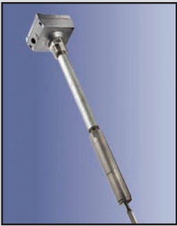
VR-41 Vibrating Rod

Power Requirements: Wide range 20-250V AC/DC Relay: SPDT relay, 5A @ 250 VAC (optional DPDT relay available) Time Delay: 1 second from stop of vibration, 2 to 5 seconds for start of vibration Ambient Temp: -4°F to +150°F (-20°C to +65°C) Process Temp: To 176°F standard (80°C); to 284°F high temp (140°C) Pressure: 145 psi Enclosure: Die cast aluminum, NEMA 4, 5 & 12 Probe: 304 stainless steel, 7.37" insertion length Mounting: 1-1/2" NPT Material densities: From 1.25 lb./cu. ft.