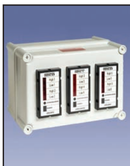
BM-12 Point Level Alarm Panel

Switch Ratings: 15 Amps @125 or 250, 1/8 HP @ 125 VAC, 1/4 HP @ 250 VAC, 1/2 Amp @ 125 VDC, 1/4 Amp @ 250 VDC Operating Temp: -40°F to +300°F (-40°C to +149°C) Approvals & Certifications: Listed for Class II, Groups E, F & G Hazardous Locations Enclosure Type: NEMA 4, 5, 9 & 12 Housing Enclosure: Die cast aluminum Mounting: Internal or external, 16 gauge galvanized mounting plate