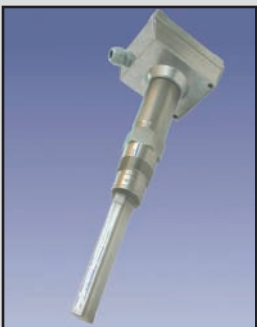
SHT-120/140 Vibrating Rod

Power Requirements: Wide range 20-250V AC/DC Power Consumption: 3 VA Relay: SPDT 5A 250 VAC Time Delay: 1 second from stop of vibration, 2 to 5 seconds for start of vibration Ambient Temp: -4°F to +150°F (-40°C to +65°C) Process Temp: To 176°F standard (80°C); to 300°F high temp (150°C) Pressure: 145 psi Wiring Cable: 1/2" Mounting: 1" NPT Enclosure: Die cast aluminum, NEMA 4, 5 & 12 Probe: 304 stainless steel, 6" insertion length Material Density: From 3.5 lb./cu. ft.