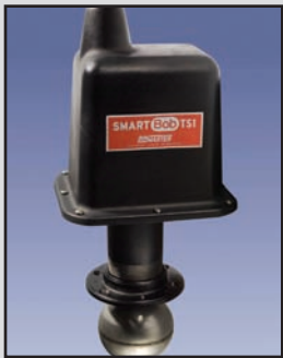
SmartBob-TS1 Cable-Based Sensor

Power Requirements: 115/230 VAC 50/60 Hz Ambient Temp: -40°F to +185°F (-40°C to +85°C) Process Temp: Up to 500°F (260°C) Measurement Range: Up to 180' Measurement Rate: 2 feet per second Accuracy: 0.1% Mounting: 3"- 8" NPT Enclosure: Molded polycarbonate Approvals & Certifications: Listed for Class II, Groups E, F, & G Hazardous Locations Enclosure Type: NEMA 4X, 5, 9 & 12