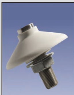
Airbrator Aeration & Vibration

Input Voltage: 115 VAC ± 10%, 50/60 Hz, 3 VA. 230 VAC ± 10%, 50/60 Hz, 3 VA. 24-48 VDC, 2 W maximum Relay: SPDT, 2 Amp 240 VAC Enclosure: NEMA 4X Operating Temp: -4°F to +158°F (-20°C to +70°C) Warranty: One year