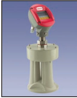
3DLevelScanner Non-Contact Sensor