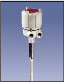
PROCAP IX & IIX Capacitance Probe

PROCAP I Power Requirements: Universal power supply 24 to 240 VAC/VDC PROCAP II Power Requirements: Selectable 115/230 VAC Output Relay: DPDT 10 Amp at 250 VAC Ambient Temp: -40°F to +185°F (-40°C to +85°C) Process Temp: To 250°F Delrin/Bare probe (121°C); to 500°F Teflon probe (260°C) Pressure: 500 PSI Approvals & Certifications: Listed for Class II, Groups E, F & G Hazardous Locations Enclosure Type: NEMA 4X, 5, 9 & 12 Housing Enclosure: Die cast aluminum, USDA approved powder coat finish Mounting: 1-1/4" NPT or 3/4" NPT 316 SS standard; 1-1/4" NPT 316 SS & sanitary flange optional