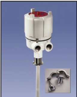
PROCAP I & II 3-A Capacitance Probe

PROCAP IX Power Requirements: Universal power supply 24 to 240 VAC/VDC PROCAP IIX Power Requirements: Selectable 115/230 VAC Output Relay: DPDT 10 Amp at 250 VAC Ambient Temp: -40°F to +185°F (-40°C to +85°C) Process Temp: To 250°F Delrin probe (121°C); to 500°F Teflon probe (260°C) Pressure: 500 PSI Approvals & Certifications: Listed for Class I, Groups C & D and Class II, Groups E, F & G Hazardous Locations Enclosure Type: NEMA 4X, 5, 7, 9 & 12 Housing Enclosure: Die cast aluminum, USDA approved powder coat finish Mounting: 1-1/4" NPT or 3/4" NPT 316 SS standard; 1-1/4" NPT 316 SS & sanitary flange optional