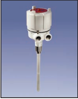
PROCAP I & II Capacitance Probe