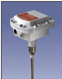
Dust Detect 1000 Dust Detection

Power Requirement: 115 or 230 VAC 50/60 Hz, 5 VA Operating Temp Remote: -22°F to +158°F (-30°C to +70°C) Operating Temp Console: -31°F to +158°F (-35°C to +70°C) Process Temp: 250°F (121°C) if ambient air temperature is below 150°F (65°C) Detection Range: Up to 10 feet Frequency: 24.125 GHz, less than 1mW/cm 3 (OSHA limit is 10mW/cm 3 ) Remote Enclosure: Die cast aluminum Remote Approvals: Listed for Class II, Groups E, F & G Hazardous Locations Enclosure Type: NEMA 4X, 5, 9 & 12 Output: DPDT dry contacts, 5A @ 240 VAC, or 30 VDC Time Delay: Single turn 0.1-15 sec