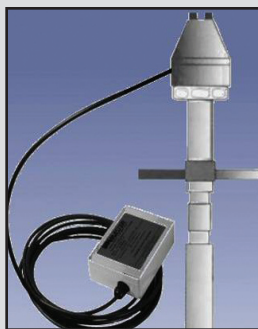
PRO HTRC-20 Capacitance Probe

Power Requirements: 115, 230 VAC or 24 VDC Output Relay: SPDT 5 amp at 250 VAC Ambient Temp: -40°F to +185°F (-40°C to +85°C) Process Temp: To 240°F (116°C) Pressure: 150 PSI Approvals & Certifications: NEMA 4X, 5 & 12 Enclosure: PVC Probe: CPVC Mounting: 1" NPS (1-1/4" adapter available) LED: Indicates material presence or absence