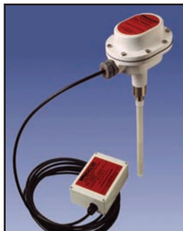
PRO REMOTE Capacitance Probe