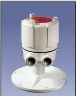
PROCAP I & II FL Capacitance Probe

PROCAP I 3-A Power Requirements: Universal power supply 24 to 240 VAC/VDC PROCAP II 3-A Power Requirements: Selectable 115/230 VAC Output Relay: DPDT 10 Amp at 250 VAC Ambient Temp: -40°F to +185°F (-40°C to +85°C) Process Temp: To 250°F Delrin probe (121°C); to 500°F Teflon probe (260°C) Pressure: 500 PSI Approvals & Certifications: Listed for Class II, Groups E, F & G Hazardous Locations Enclosure Type: NEMA 4X, 5, 9 & 12 Housing Enclosure: Die cast aluminum, USDA approved powder coat finish Mounting: 1" or 2.5" sanitary flange