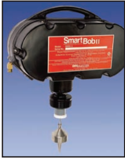
SmartBob2 Cable-Based Sensor