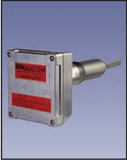
VR-21 Vibrating Rod