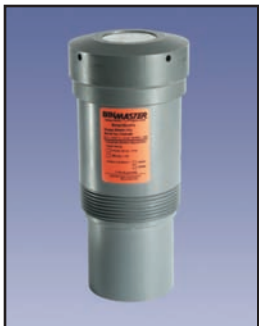
SmartSonic Ultrasonic Transmitter

Power Requirements: 115/230 VAC 50/60 Hz Ambient Temp: -20°F to +140°F (-29°C to +60°C) Process Temp: Up to 140°F (60°C) Measurement Range: 40 feet Measurement Rate: 1 foot per second Accuracy: 0.1% Mounting: Special bolt on or 3" - 6" NPT Enclosure: Rotational molded polyethylene Approvals & Certifications: NEMA 4X (IP65)