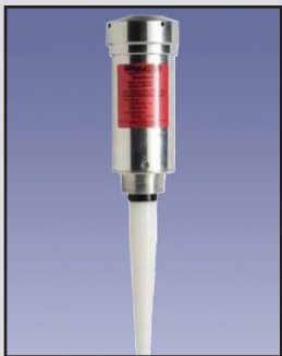
SmartWave Pulse Radar Transmitter

Power Requirements: AC units 115 VAC 60 Hz or 230 VAC 50 Hz; DC units 12 to 30 VDC 0.07 Amps Ambient Temp: -40°F to +140°F (-40°C to +60°C) Process Temp: Up to 200°F (93°C) Operation: Ultrasonic Frequency: 25 to 148 KHz Measurement Range Liquids: 90' maximum Measurement Range Solids: 40' maximum Accuracy: ± 0.25% Beam Angle: 6° - 12° conical at -3dB Temp Compensation: Continuous in transducer Output: 4-20 mA and RS-485 Mounting: 3" NPT Enclosure: PVC-94VO Approvals & Certifications: NEMA 4X (IP65)