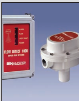
Flow Detect 1000 Microwave Flow Detection

Preferred Applications: Powders and solids Measuring Range: 200 feet (61 meters) Supply Voltage: 20 - 32 VDC Process Temp: -40°F to 176°F (-40°C to 80°C) Process Pressure: -2.9 to 14.5 PSI Signal Output: 4-wire 4-20mA/HART/RS-485/Modbus Emitting Frequency: 2.6 KHz to 7 KHz Housing: Aluminum die cast powder coated