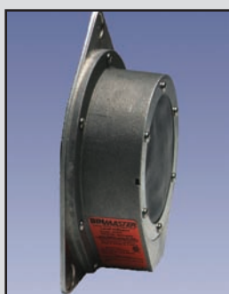
BM-65 Diaphragm Switch

Switch Ratings: 15 Amps @125, 250 or 480 VAC, 1/8 HP @ 125 VAC, 1/4 HP @ 250 VAC, 1/2 Amp @ 125 VDC, 1/4 Amp @ 250 VDC Operating Temp: -40°F to +300°F (-40°C to +149°C) Housing Enclosure: Die cast aluminum Mounting: Internal or external, 16 gauge galvanized mounting plate