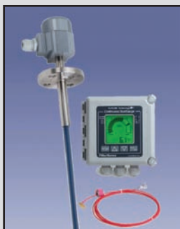
BM-30 LGX Particulate Monitor

Power Requirements: 115 VAC, 50/60 Hz ±15%, 5 VA, 230 VAC optional Output Relay: Two SPDT 10 Amp relays (warning & alarm) Ambient Temp: -25°F to +160°F (-32°C to +71°C) Process Temp: Up to 250°F (121°C) Pressure: 500 PSI Housing Enclosure: Cast aluminum, USDA approved powder coat finish Mounting: 1-1/4" NPT or 3/4" NPT 316 SS Standard: 1-1/4" NPT 316 stainless steel & sanitary flange optional Alarm: Dual alarm (alarm is 2x pre-alarm) switch selectable for instantaneous or one minute averaged Sensitivity: 1 mg/m (.0005 gr/SCF)